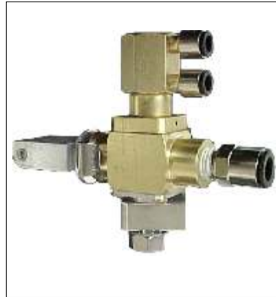
47 Series Adhesive Valve