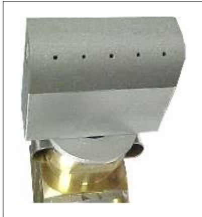
30 Series Applicator Head